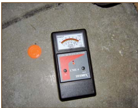
Photo 8 – At all noncarpeted areas, the metered MC of the concrete surface exceeds 5.0%. (The orange cap covers an internal RH sensor per ASTM F2170.)