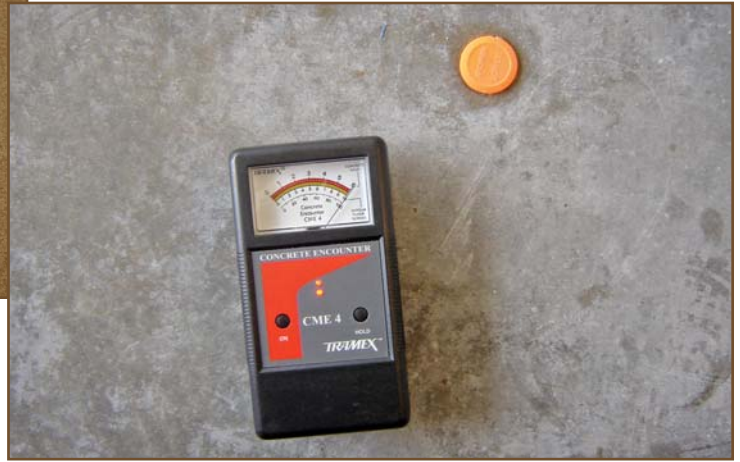
Photo 5 – At all carpeted areas, the metered MC of the concrete surface exceeds 6.0%. (The orange cap covers an internal RH sensor, per ASTM F2170.)

accompanying photographs taken at the carpeted offices adjacent to the storage areas. As seen in Photos 3 through 7, exceedingly high moisture levels at the concrete floor resulted in failure and deterioration of the water-soluble adhesive used at the rubber-backed carpet tiles.