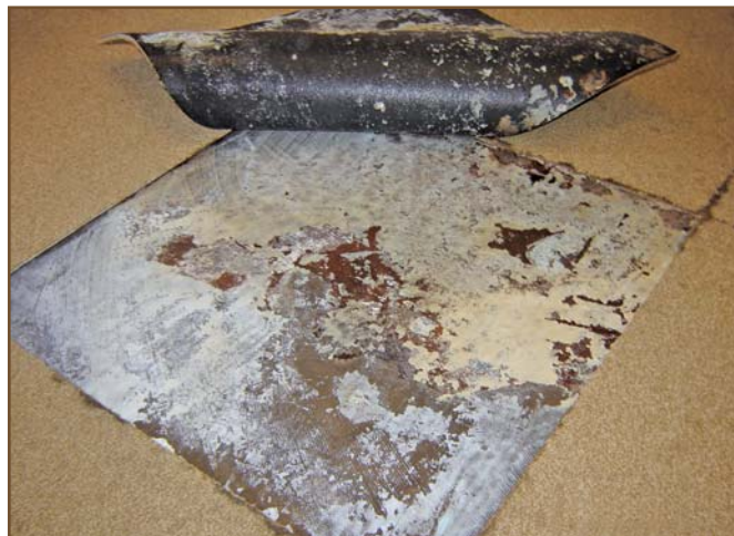
Photo 3 – Excess moisture has emulsified and deteriorated the water-soluble latex adhesives.

At this particular project, these warnings are graphically demonstrated by the