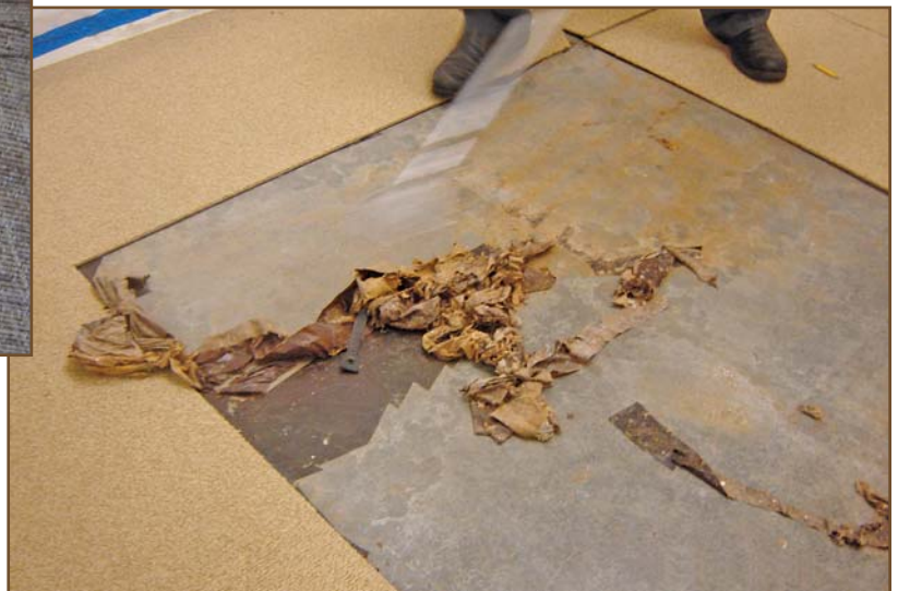
Photo 7 – Most of the failed adhesive is easily scraped from the wet concrete slab.