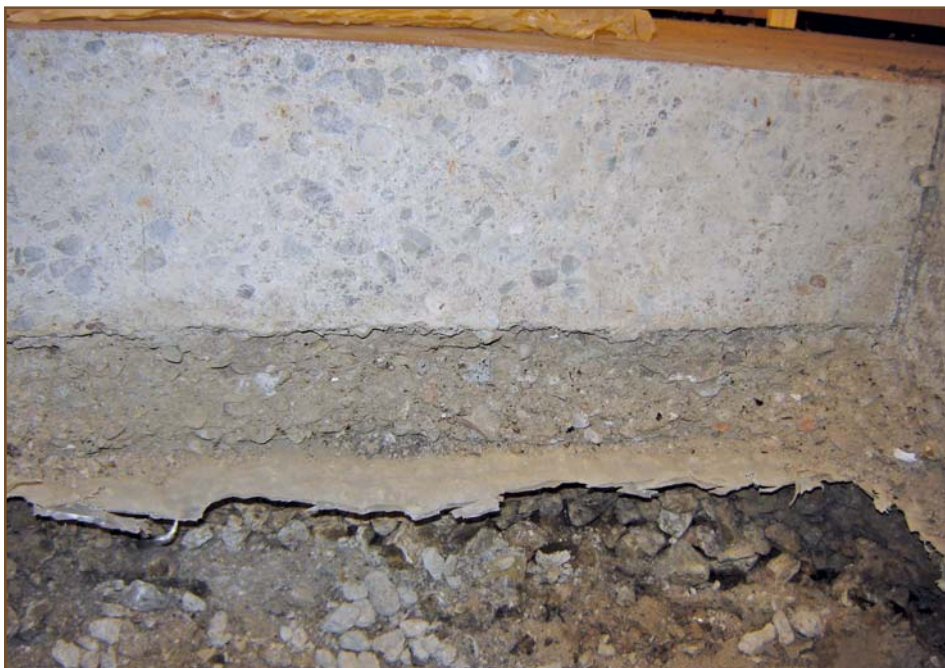
Photo 1 – Test cut at concrete slab reveals compacted granular fill above the plastic vapor barrier and the granular drainage base.

Further, as seen in Photo 2 , numerous punctures in the polyethylene sheeting