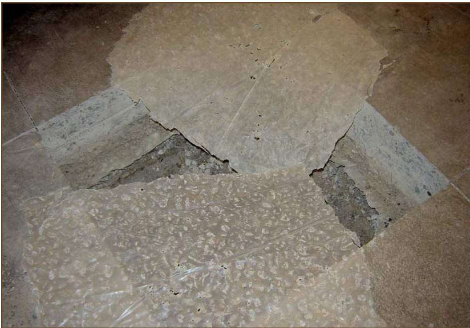
Photo 2 – Polyethylene sheeting has numerous punctures, thus negating its usefulness as a vapor barrier.

have destroyed its usefulness as a vapor barrier, thus fully negating the predictive capabilities of our moisture-testing data: