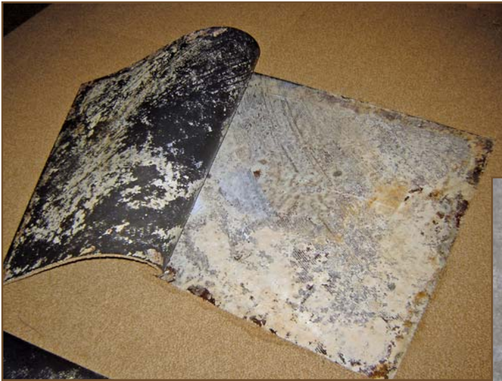
Photo 4 – Excess moisture has emulsified and deteriorated the water-soluble latex adhesives.