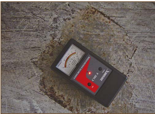
Photo 6 – At all carpeted areas, the metered MC of the concrete surface exceeds 6.0%.

Compare Photo 8, taken at one of the storage rooms, with Photos 5 and 6. We see that the MC of the noncarpeted portions of the concrete slab also is unusually high, albeit significantly lower than at the adja-