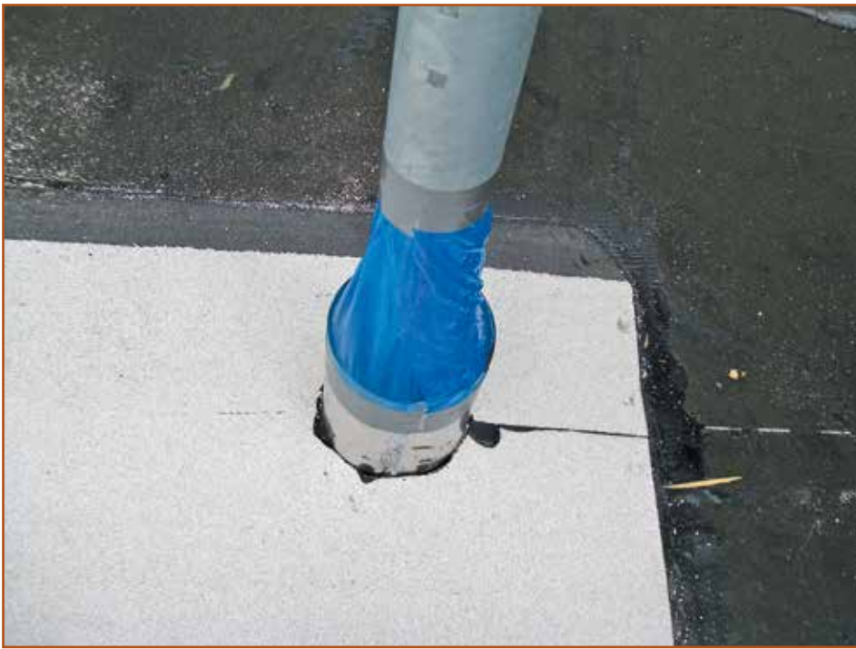
Photo 9 – Plastic sheet and tape applied over top of flashing pan.

brane would serve as a more permanent option for daily watertightness for the project duration.