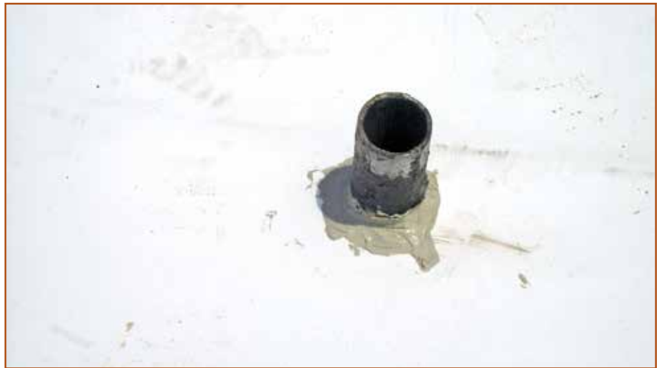
Photo 11 – Sealant applied around penetration in single ply as temporary seal.

Urethane sealant is commonly used as the