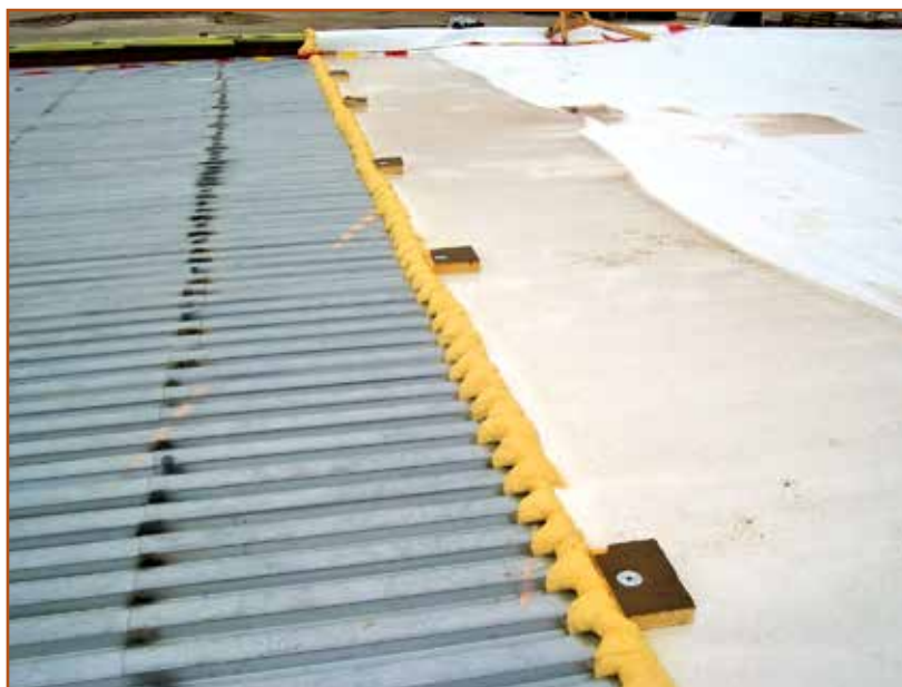
Photo 12 – Spray foam applied along tie-in of single ply on metal deck.

At walls and curbs, the single-ply flashing can either be adhered or installed loose, depending on the vertical height of the substrate and project or manufacturer requirements. When the flashing is terminated on the vertical substrate, water block is commonly applied between the top edge of the flashing membrane and the vertical substrate. It is recommended to install the mechanical attachment (i.e., termination bar) along the top edge on the same day to ensure continuous proper seal and weathertight construction. If roof curbs are present and have removable hoods or equipment, or the hood or equipment has yet to be delivered, it is recommended to extend and adhere the single-ply membrane flashing up and over the top of the curb to maintain weathertightness—not only during the construction period,