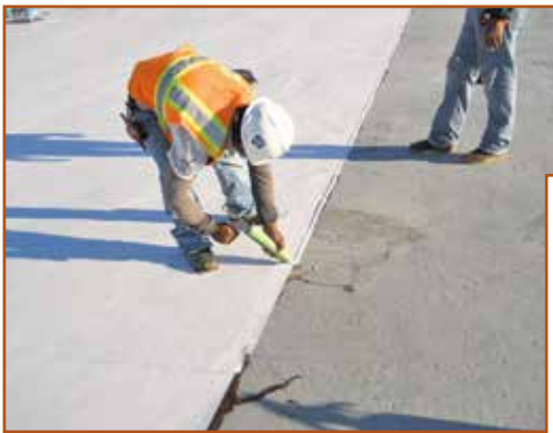
Photo 13 – Sealant applied along edge of fleece-backing single ply over lightweight insulating concrete.

but also in the future if the equipment is removed or displaced.