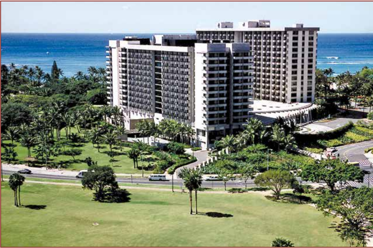
Figure 3 – Hale Koa Hotel in Honolulu.

the surrounding wall will pass with flying colors. Nothing replaces the complete building commissioning process. A “pen test” is a graphical tool used during the design phase that forces the project team to trace the planes of individual components within a wall section of a building. The intent is to check for continuity in the air, vapor, water, and thermal barriers. By tracing these planes on an architect’s drawings, members of the project team can better ensure that they will