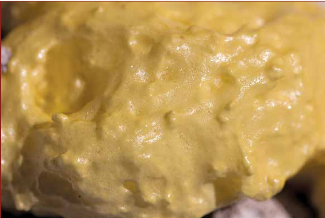
Figure 2 – Spray foam insulation.

ing performance can vary widely. Although rating systems and standards consider regional differences on some matters, they ignore certain critical points that affect the performance of the building envelope and mechanical systems. For example, if we did a peer review of a General Electric HVAC unit in a building in South Dakota, we would likely get completely different results from a similar review of the same unit